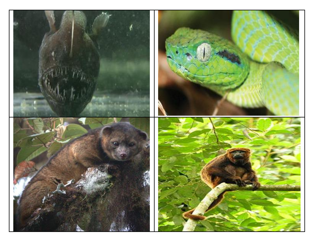
Fig.2 Species diversity of Earth