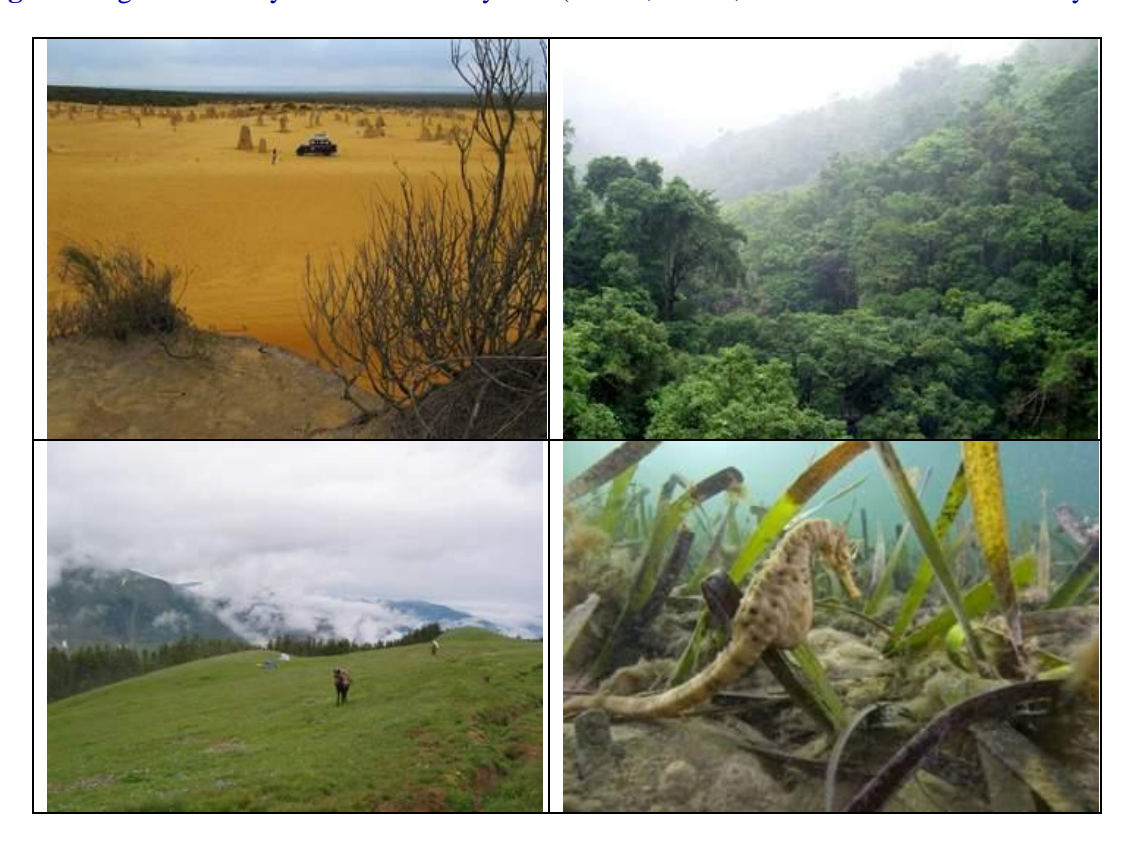
Fig.3 Biological diversity in different ecosystem (Desert, Forest, Grassland and Marine Ecosystem)

In In-situ conservation of crop genetic resources sometimes not been given importance. In Himalayan region a no. of protected areas – biosphere reserves, national parks and wildlife sanctuaries are in existence and are proposed. Rawat (1994) has proposed potential areas for plant conservation in various Biogeography zones of Himalayas.